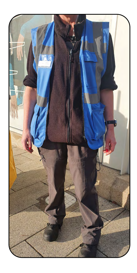
Centre Management Junction 32 lanyards with name badges